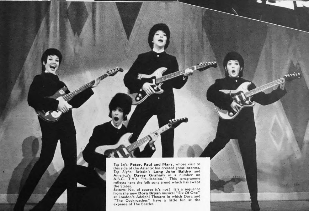
Top Left: Peter, Paul and Mary, whose visit to this side of the Atlantic has created great interest. Top Right: Britain's Long John Baldry and America's Davey Graham in a number on A.B.C. T.V.'s "Hullabaloo." This programme reflects here the folk song trend which has swept the States. Bottom: No, of course it's not! It's a sequence from the new Dora Bryan musical "Six Of One" at London's Adelphi Theatre in which Dora and "The Cockroaches" have a little fun at the expense of The Beatles.